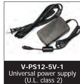
V-PS12-5V-1 Universal power supply (U.L. class 2)