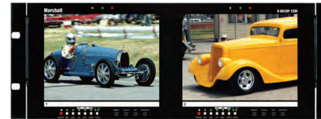
V-R82DP-2SDI Users Guide

1910 East Maple Ave. El Segundo, CA 90245 Tel.: 800-800-6608 • 310-333-0606 Fax: 310-333-0688 www.LCDRacks.com Email: sales@lcdracks.com