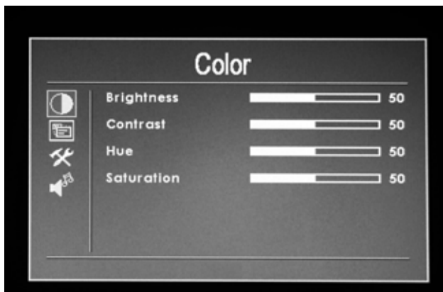
OSD in AV Mode

You can press \uparrow or \downarrow on the unit or on the remote control to select the items: COLOR ADJUST MENU FUNCTION SOUND and confirm by pressing \leftarrow or \rightarrow on the unit or on the remote control, then push \leftarrow or \rightarrow again to adjust the items. Push MENU to exit the OSD after your adjustments are complete.