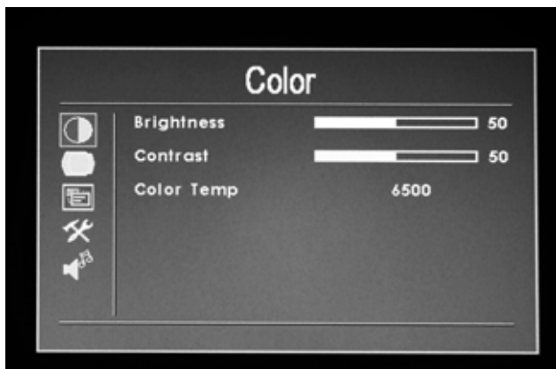
OSD in HDMI / PC Mode

After connecting power, the unit will be in standby mode, which is indicated by a red light. Press "POWER" on the unit or on the remote control, and the buttons on the unit will illuminate in blue when the unit is operational. Pressing the same button again will return the unit to STANDBY mode. Pushing "PC/AV" on the unit or the remote control to select the signal input. Push "PC/AV" on the unit or the remote control to select the signal input.