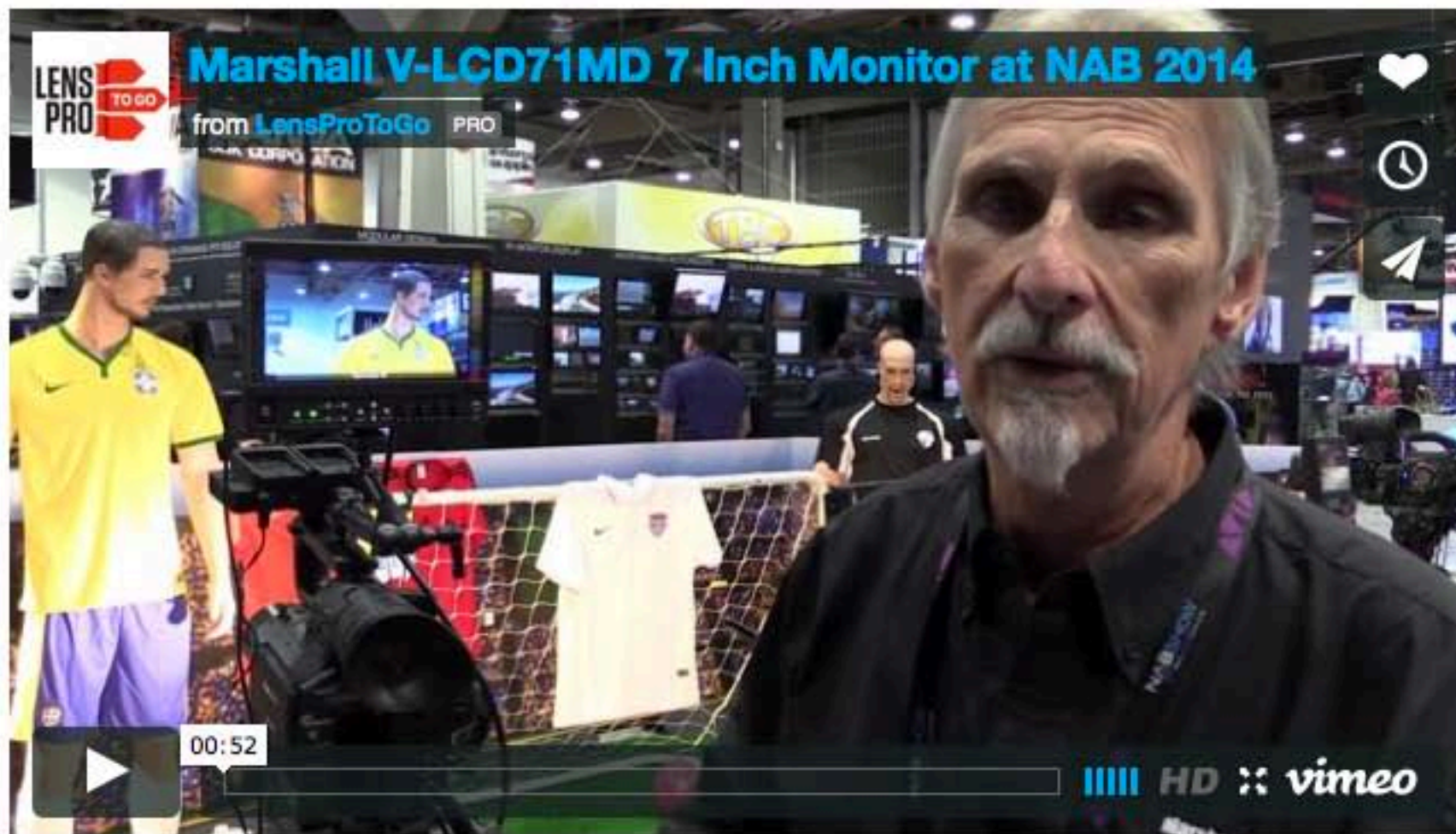
Marshall V-LCD71MD 7 Inch Monitor at NAB 2014 from LensProToGo on Vimeo.

At NAB this year, Marshall Electronics showed off their new V-LCD71MD 7 Inch Monitor that is 1920x1080px for full high definition display!