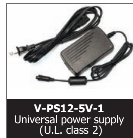
V-PS12-5V-1 Universal power supply (U.L. class 2)