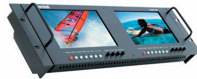
V-R72P-2SD Users Guide

1910 East Maple Ave. El Segundo, CA 90245 Tel.: 800-800-6608 • Fax: 310-333-0688 www.LCDRacks.com Email: sales@lcdracks.com