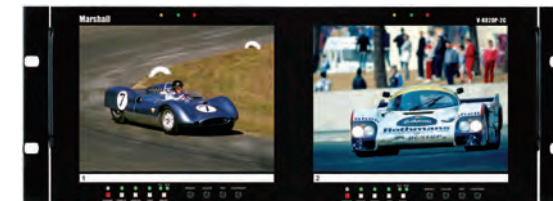
V-R82DP-2C Users Guide

1910 East Maple Ave. El Segundo, CA 90245 Tel.: 800-800-6608 • Fax: 310-333-0688 www.LCDRacks.com Email: sales@lcdracks.com