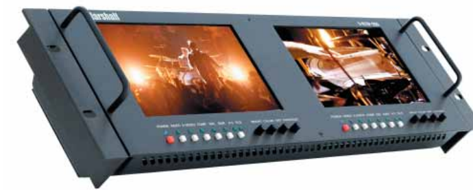
V-R72P-AFHD Users Guide

1910 East Maple Ave. El Segundo, CA 90245 Tel.: 800-800-6608 • 310-333-0606 Fax: 310-333-0688 www.LCDRacks.com Email: sales@lcdracks.com