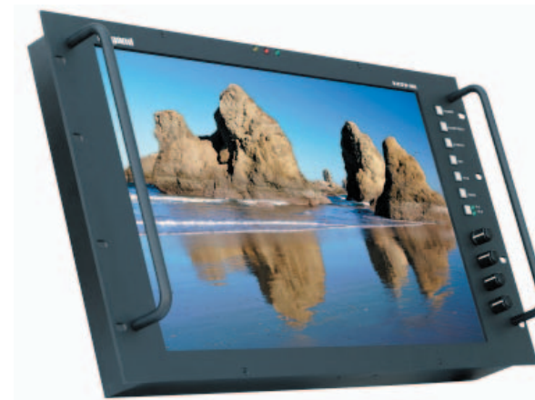
V-R171P-SDI Users Guide

1910 East Maple Ave. El Segundo, CA 90245 Tel.: 800-800-6608 • Fax: 310-333-0688 www.LCDRacks.com Email: sales@lcdracks.com